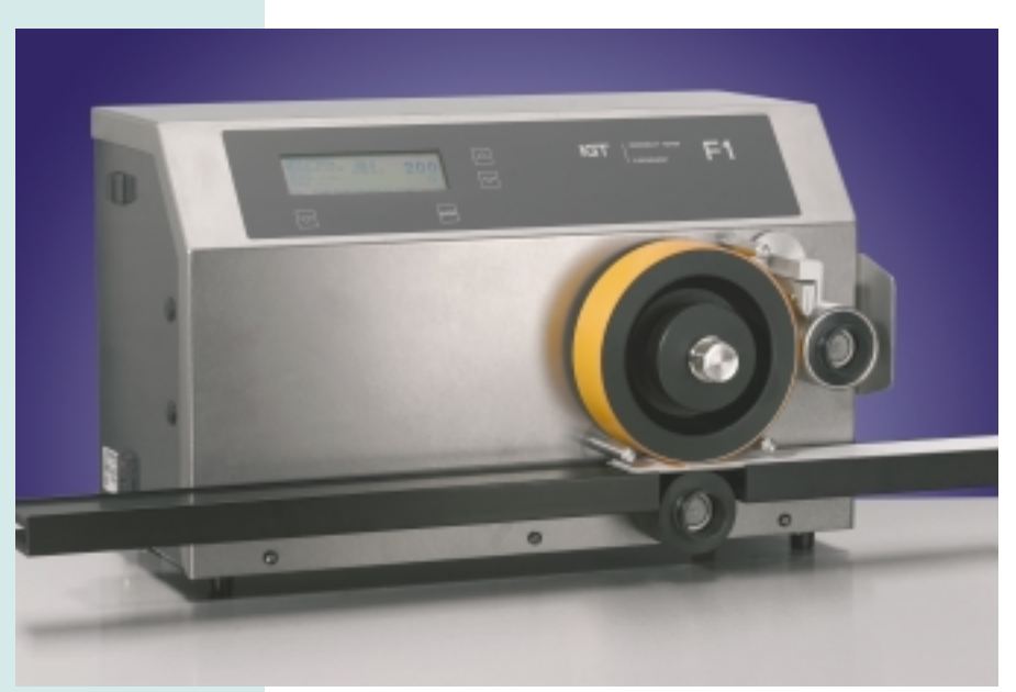
The F1, ready for use